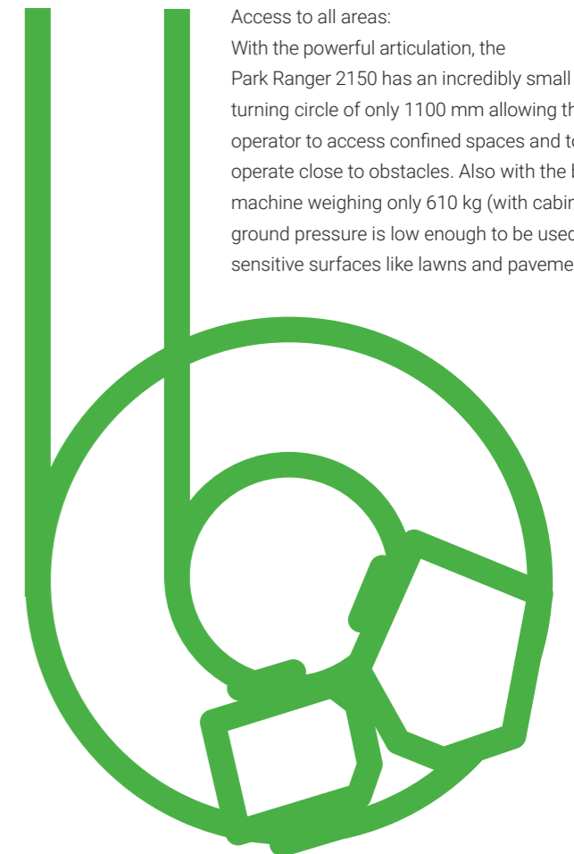
300 cm turning circle - kerb to kerb

Access to all areas: With the powerful articulation, the Park Ranger 2150 has an incredibly small inside turning circle of only 1100 mm allowing the operator to access confined spaces and to operate close to obstacles. Also with the basic machine weighing only 610 kg (with cabin), ground pressure is low enough to be used on sensitive surfaces like lawns and pavements.